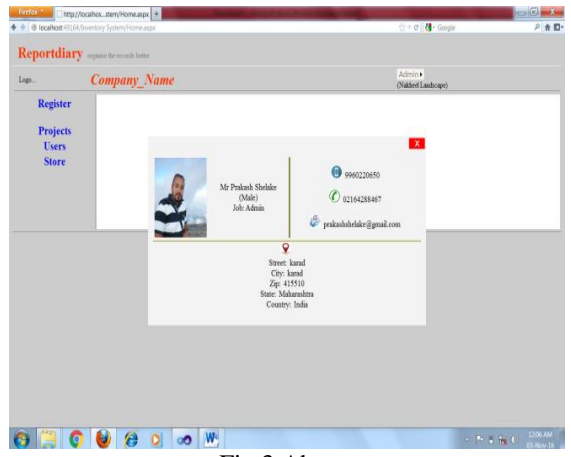
Fig 3 About